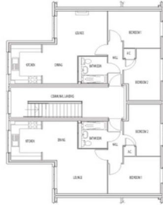
First and second floor